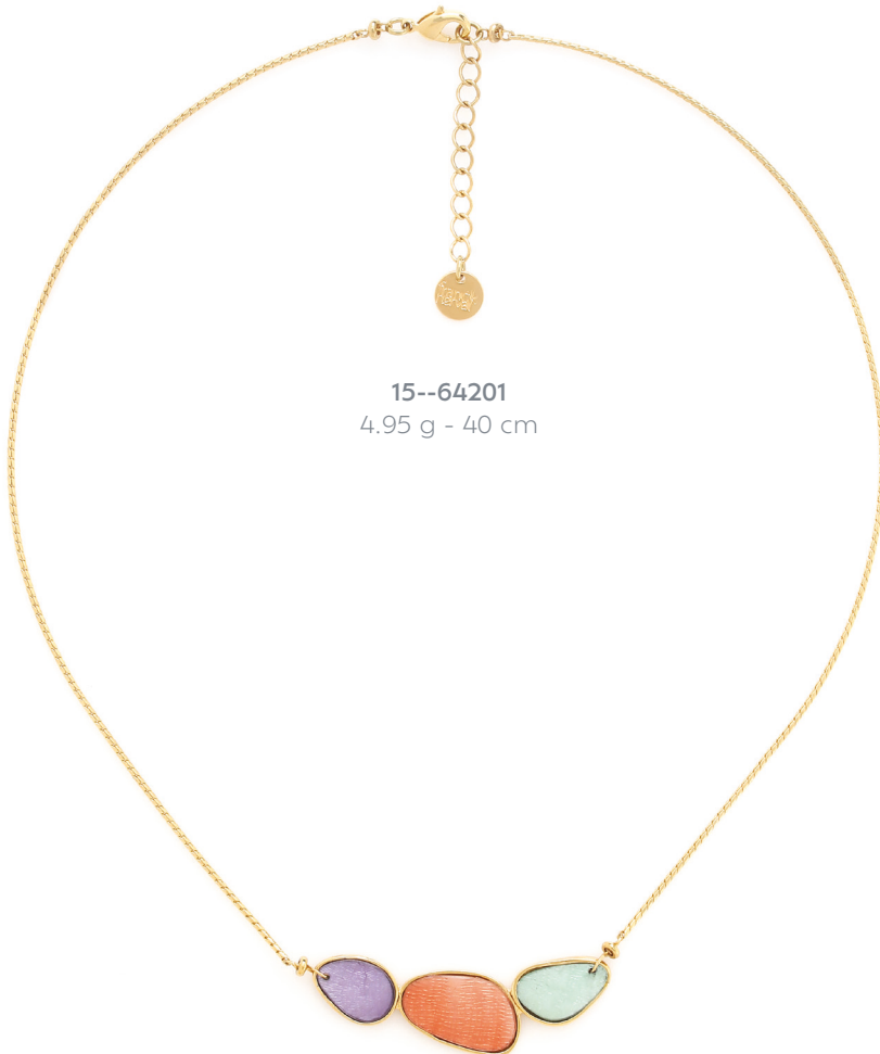
15--64201 4.95 g - 40 cm