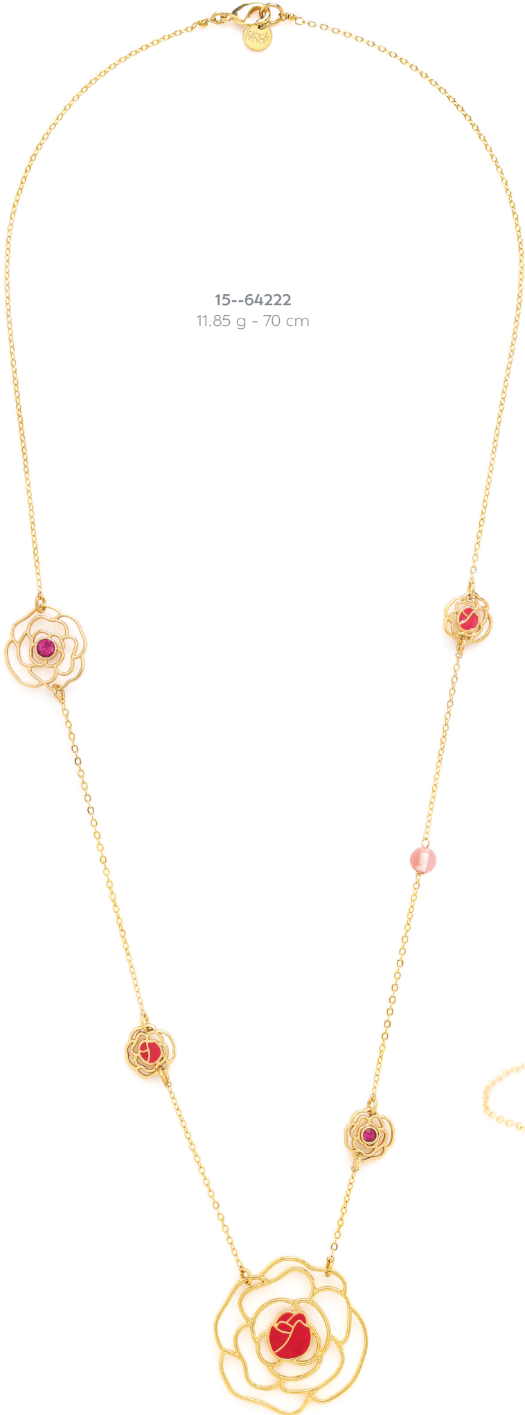
15--64222 11.85 g - 70 cm