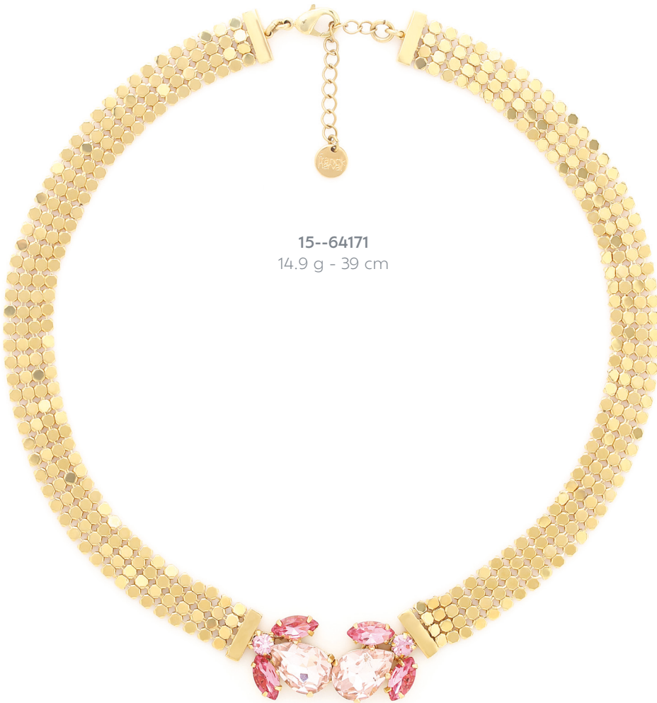
15--64171 14.9 g - 39 cm