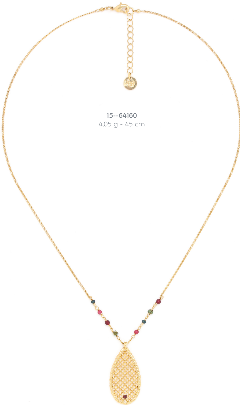
15--64160 4.05 g - 45 cm