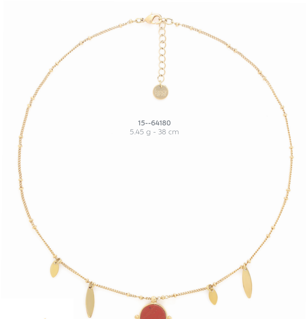
15--64180 5.45 g - 38 cm