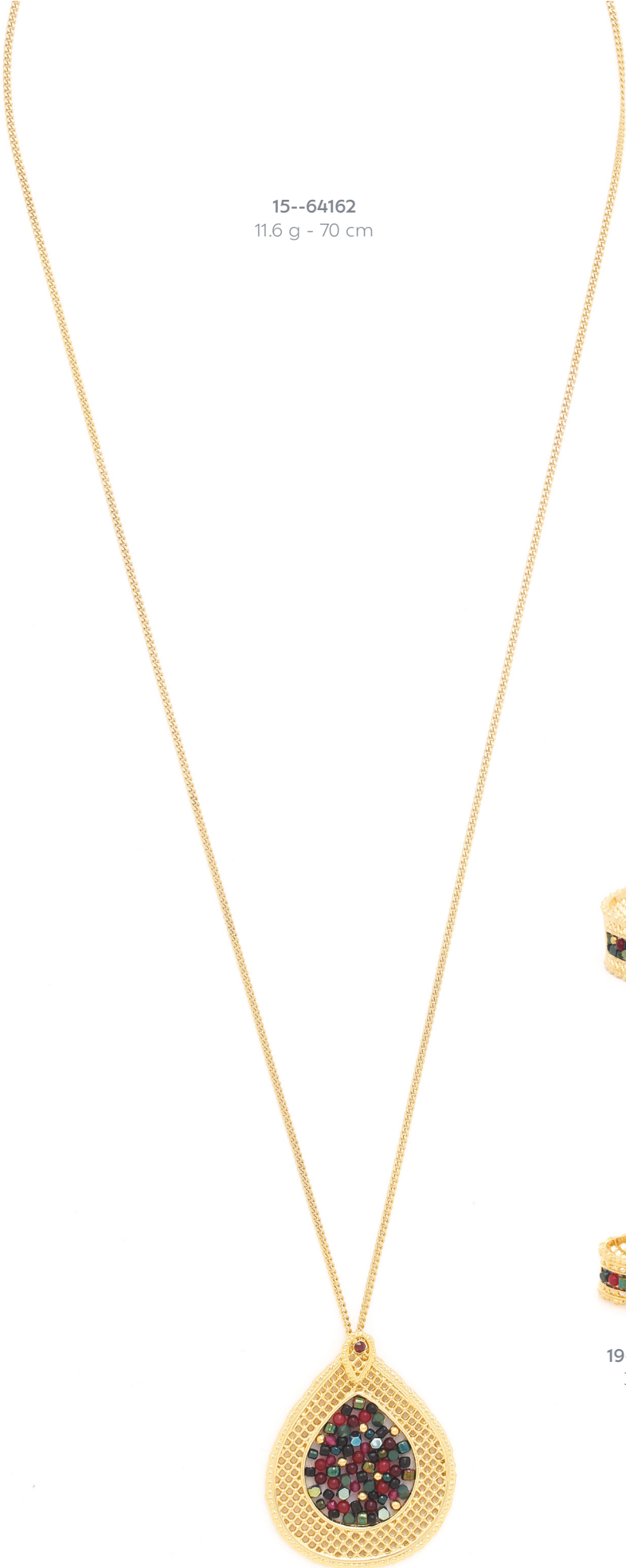
15--64162 11.6 g - 70 cm