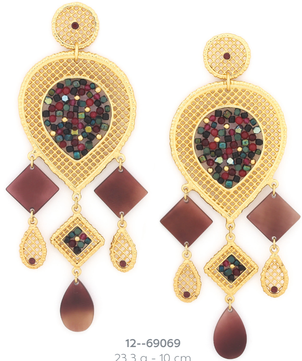
12--69069 23.3 g - 10 cm