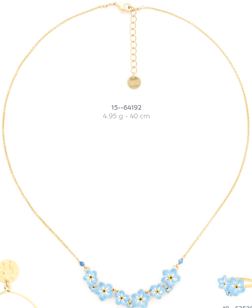
15--64192 4.95 g - 40 cm

Swarovski Agate Émail - Enamel Laiton - Brass