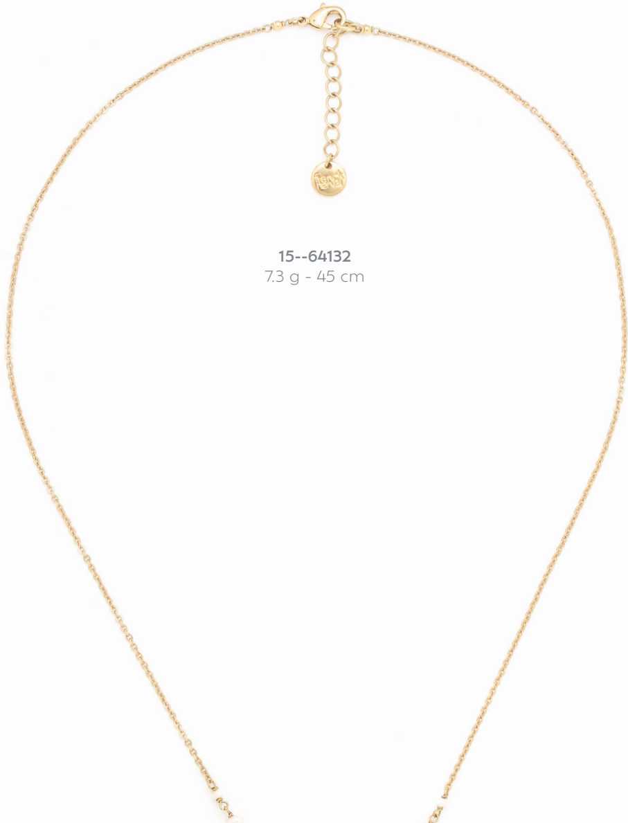
15--64132 7.3 g - 45 cm