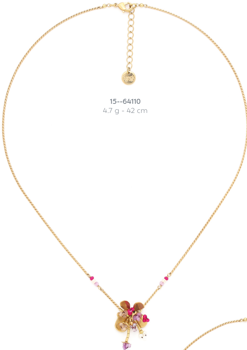
15--64110 4.7 g - 42 cm