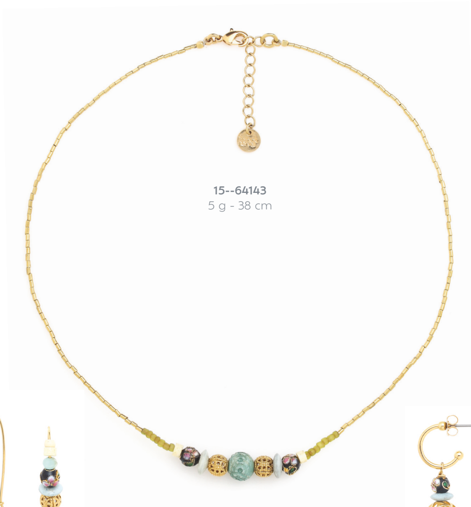
15--64143 5 g - 38 cm