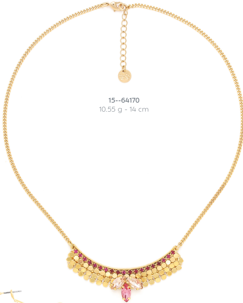
15--64170 10.55 g - 14 cm