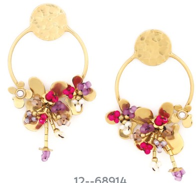
12--68914 7.55 g - 5 cm