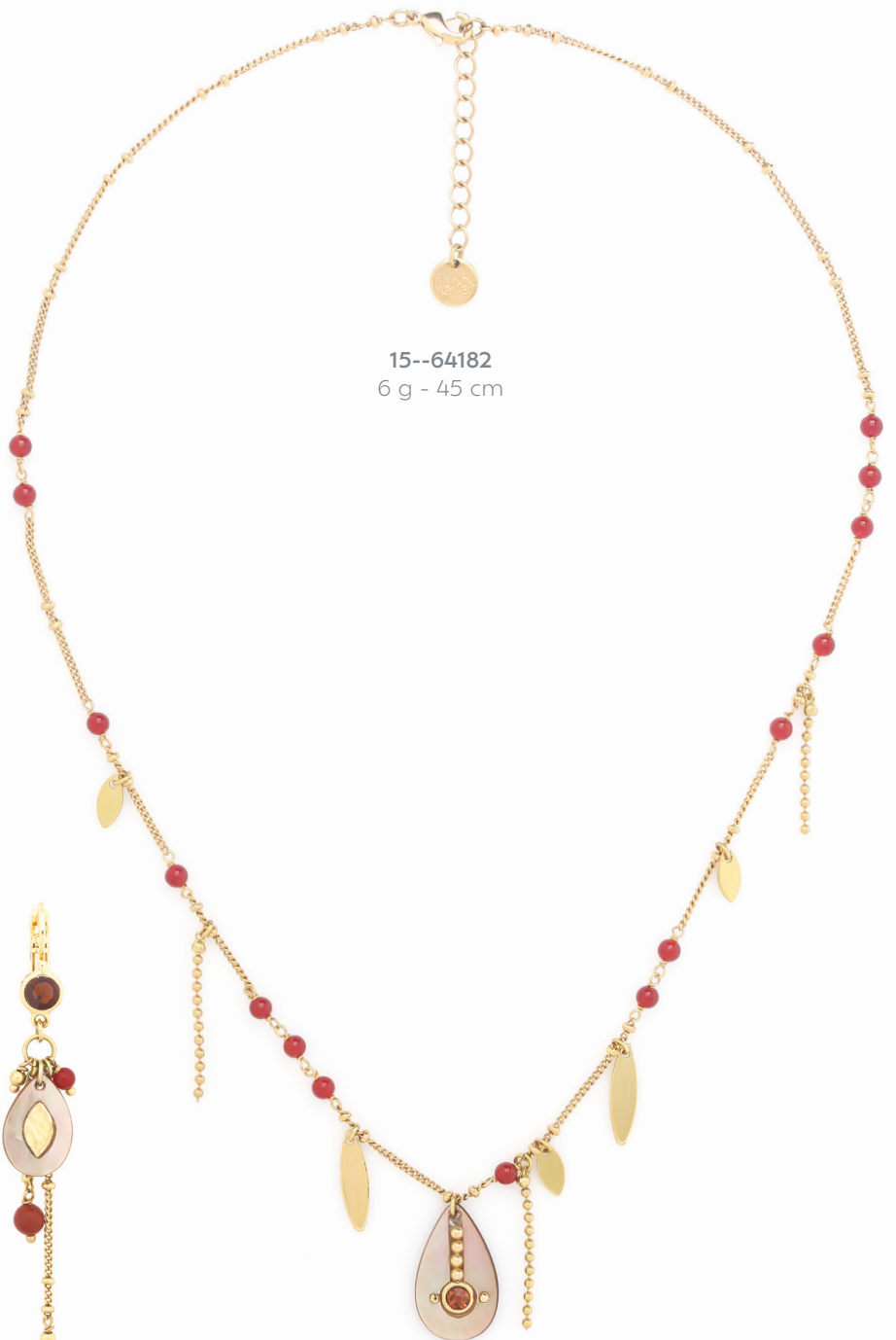
15--64182 6 g - 45 cm

Agate rouge - Red Agate Nacre brune - Brown mother of pearl Jaspe rouge - Red jasper Laiton - Brass Email - Enamel