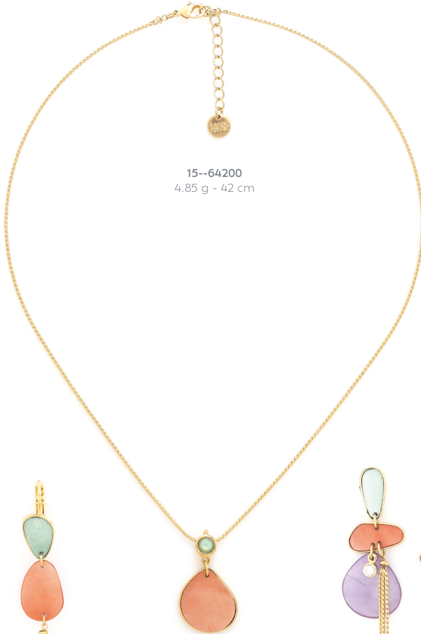
15--64200 4.85 g - 42 cm