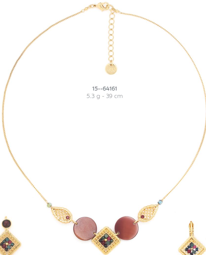
15--64161 5.3 g - 39 cm