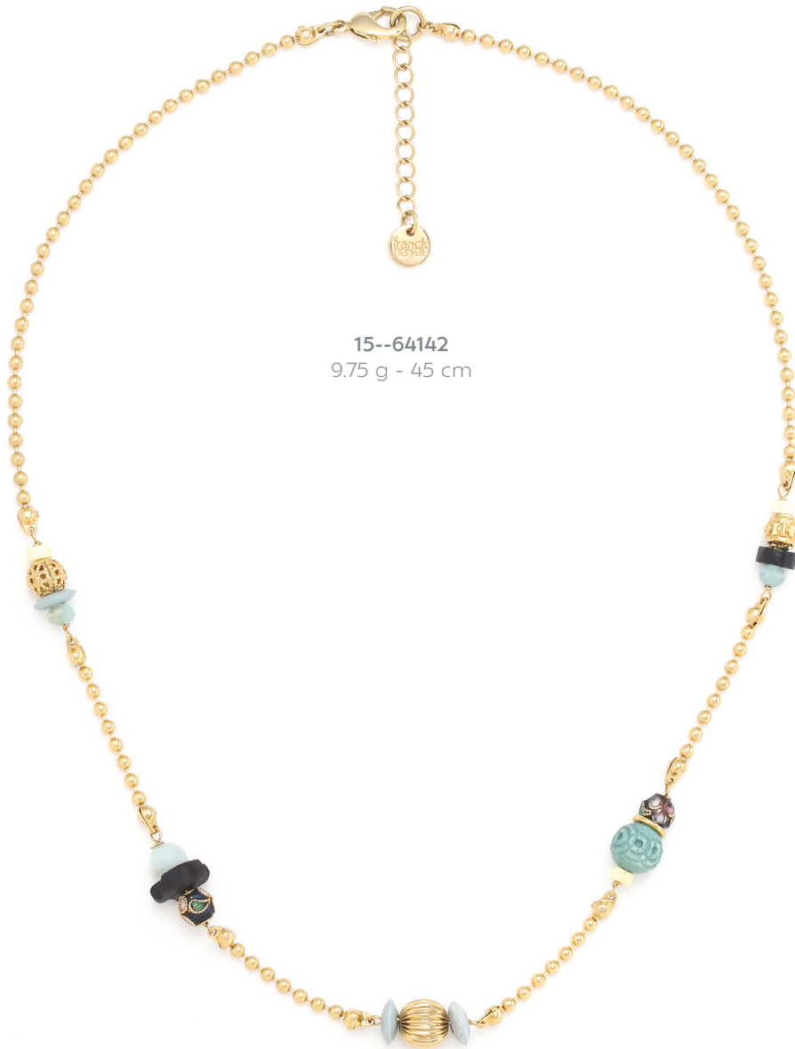
15--64142 9.75 g - 45 cm