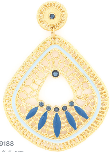
12--69188 21.65 g - 6.5 cm