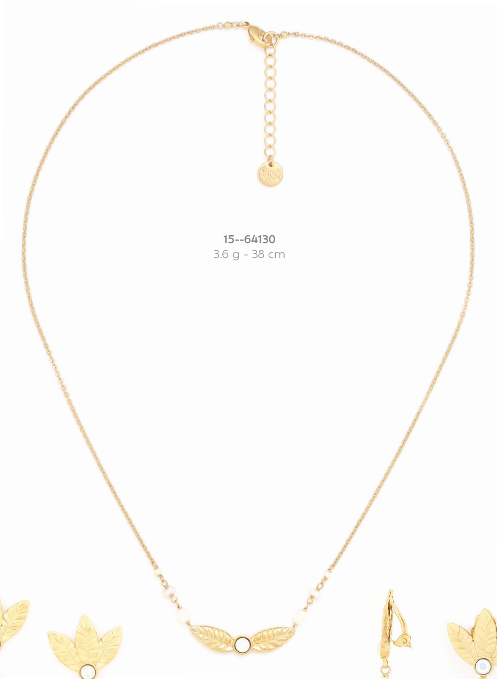
15--64130 3.6 g - 38 cm