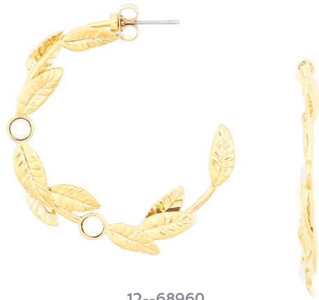
12--68960 8.1 g - 4.5 cm