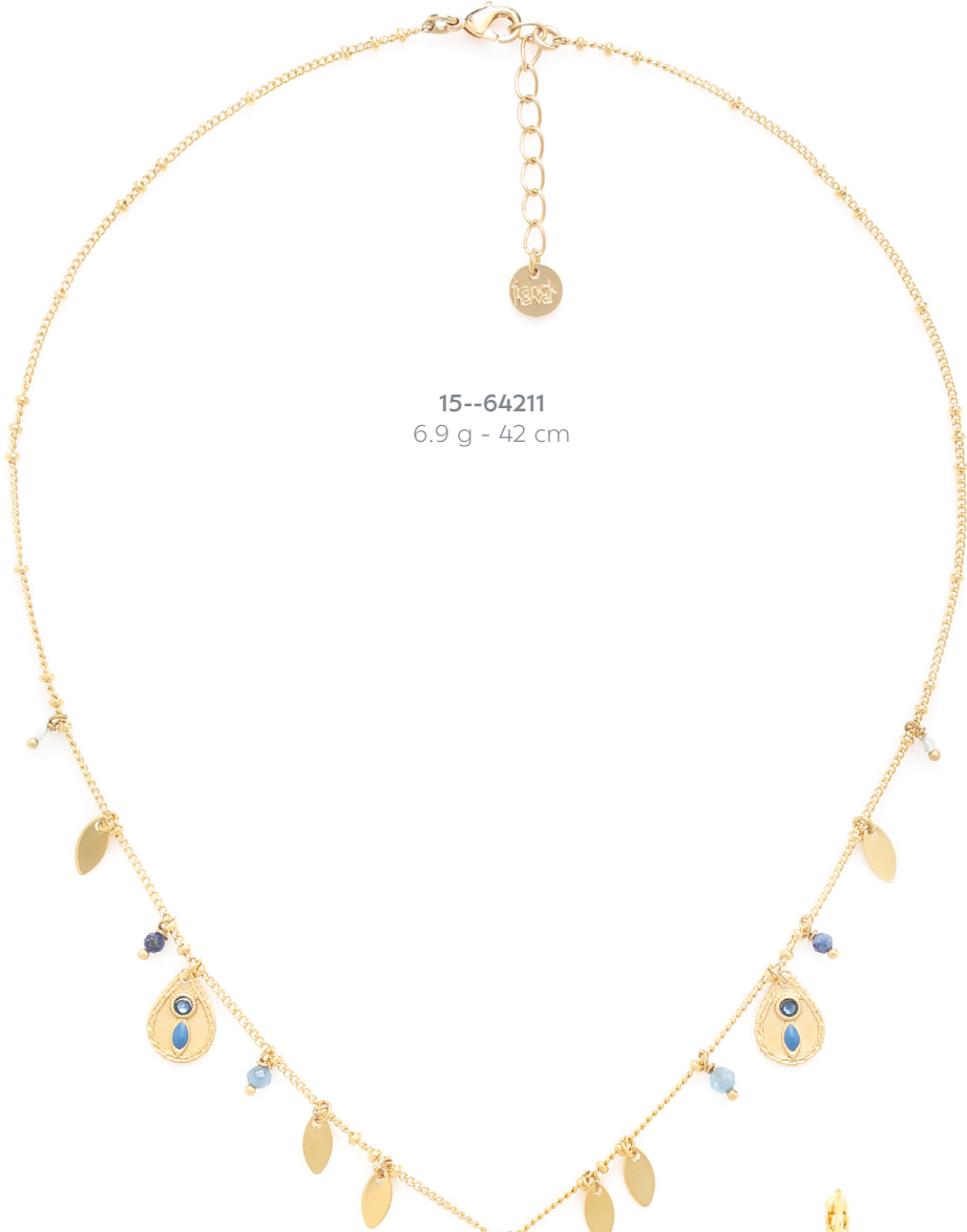
15--64211 6.9 g - 42 cm