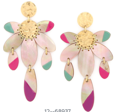
12--68937 7.75 g - 6 cm