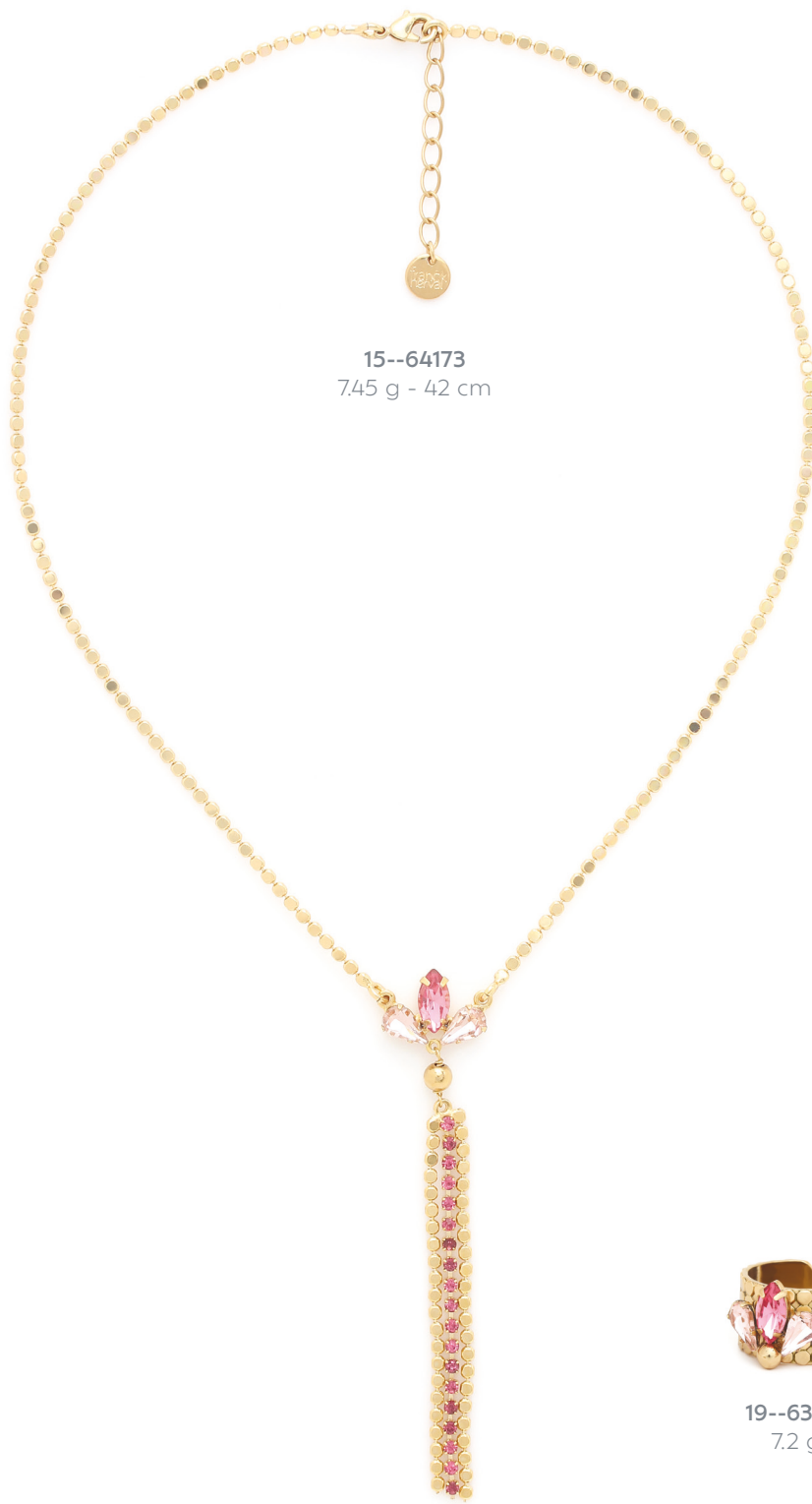
15--64173 7.45 g - 42 cm