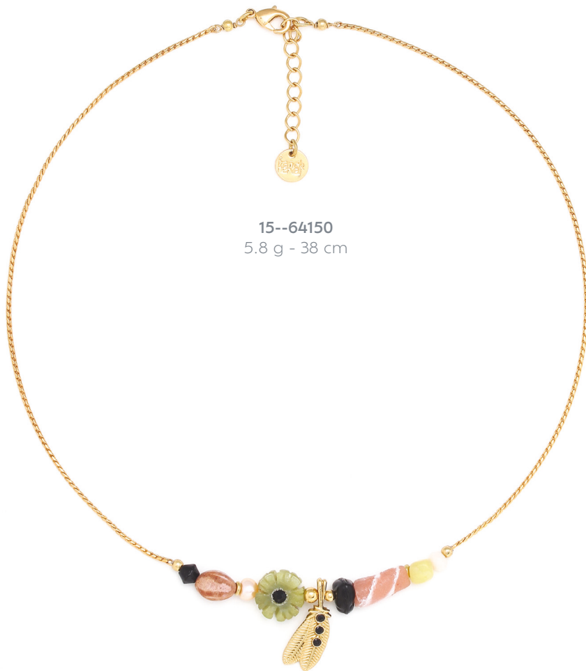
15--64150 5.8 g - 38 cm