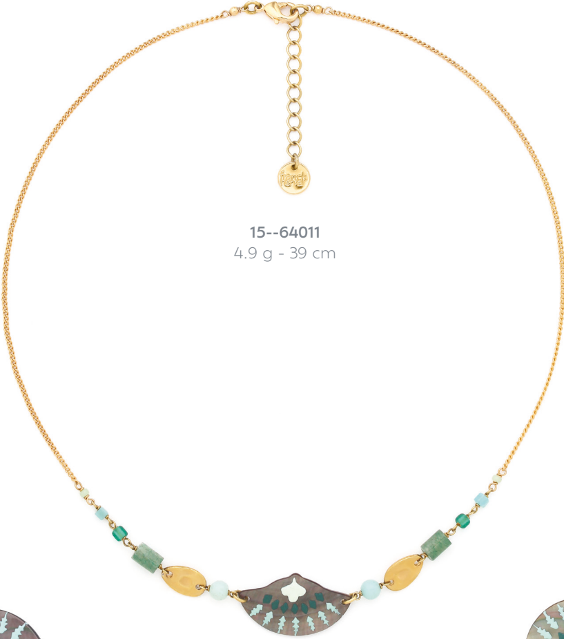
15--64011 4.9 g - 39 cm