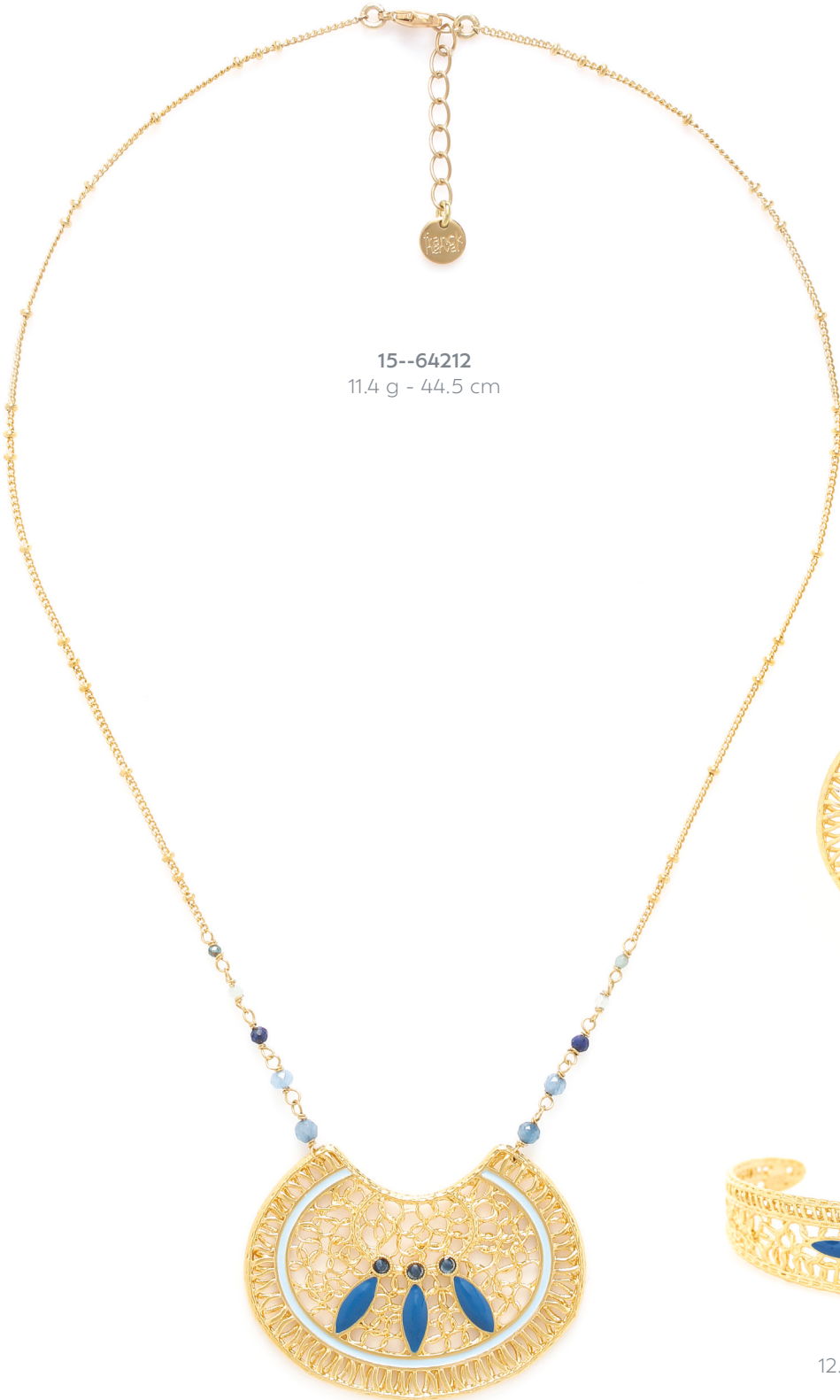
15--64212 11.4 g - 44.5 cm