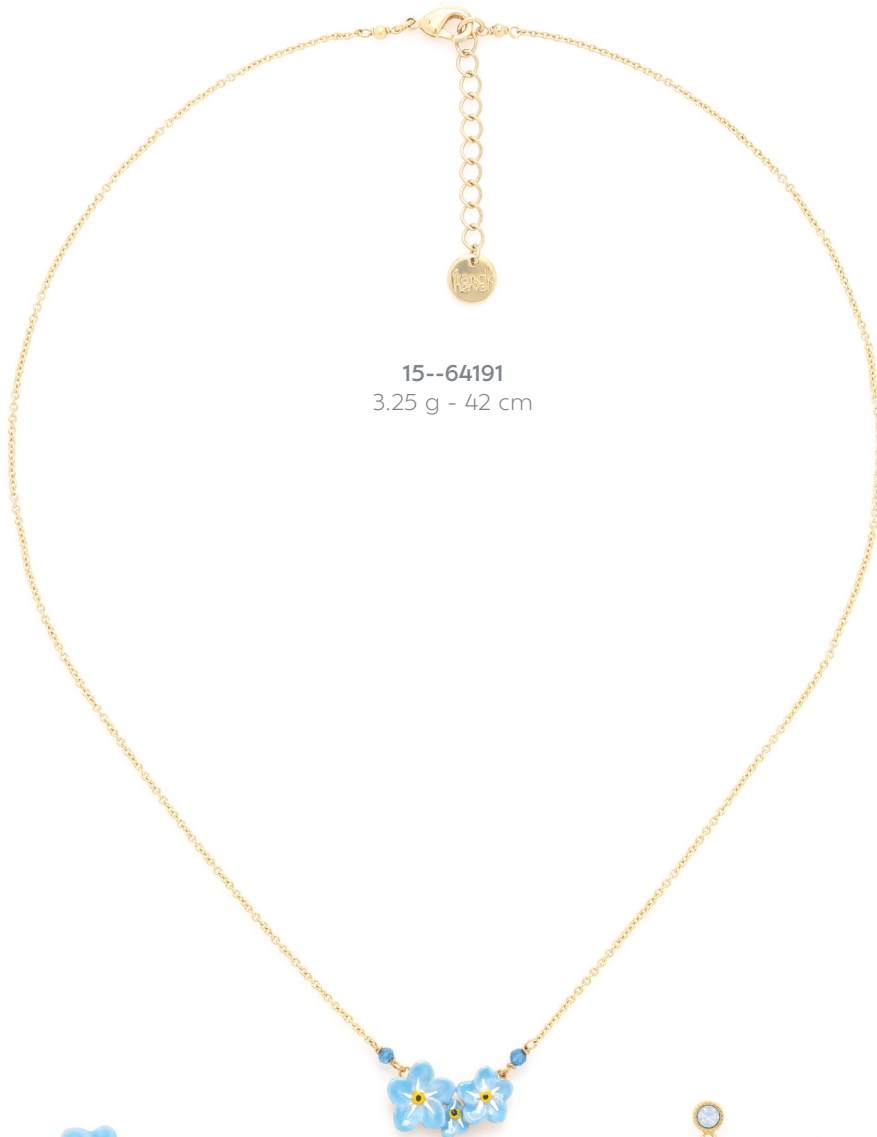
15--64191 3.25 g - 42 cm