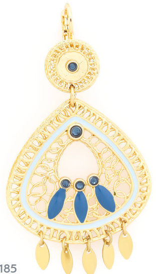
12--69185 16.75 g - 7 cm