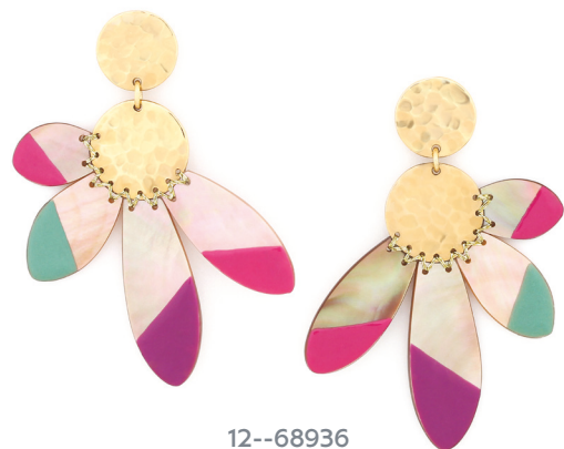
12--68936 8.75 g - 5.5 cm