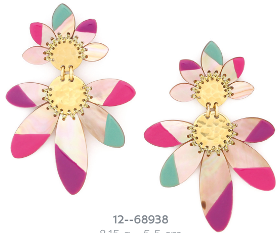
12--68938 8.15 g - 5.5 cm