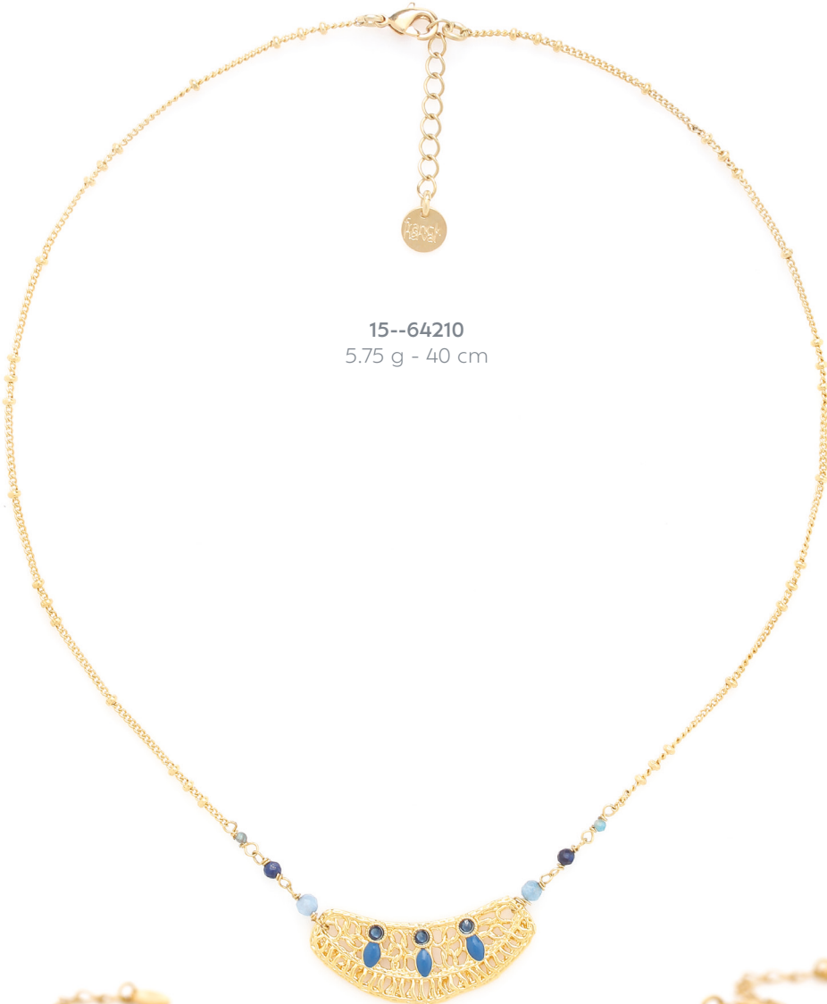
15--64210 5.75 g - 40 cm