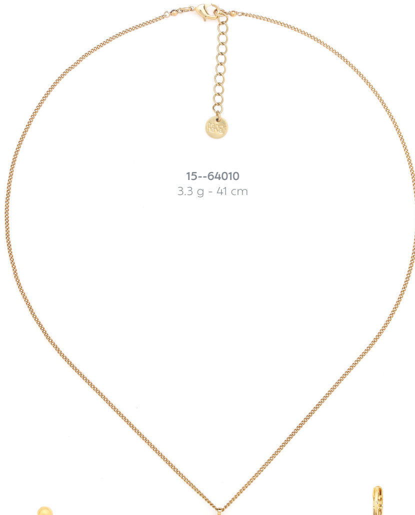
15--64010 3.3 g - 41 cm