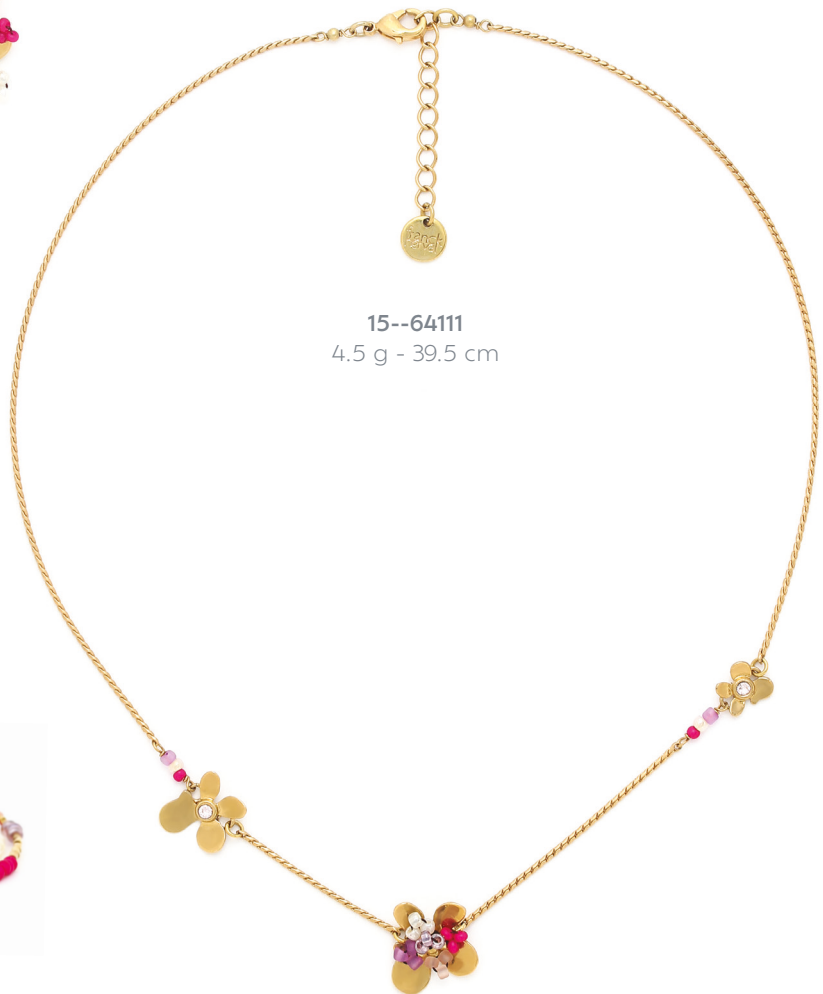
15--64111 4.5 g - 39.5 cm