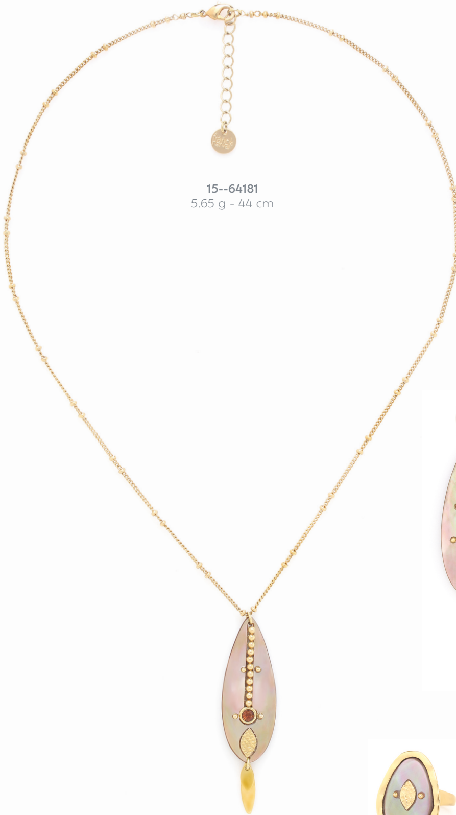
15--64181 5.65 g - 44 cm