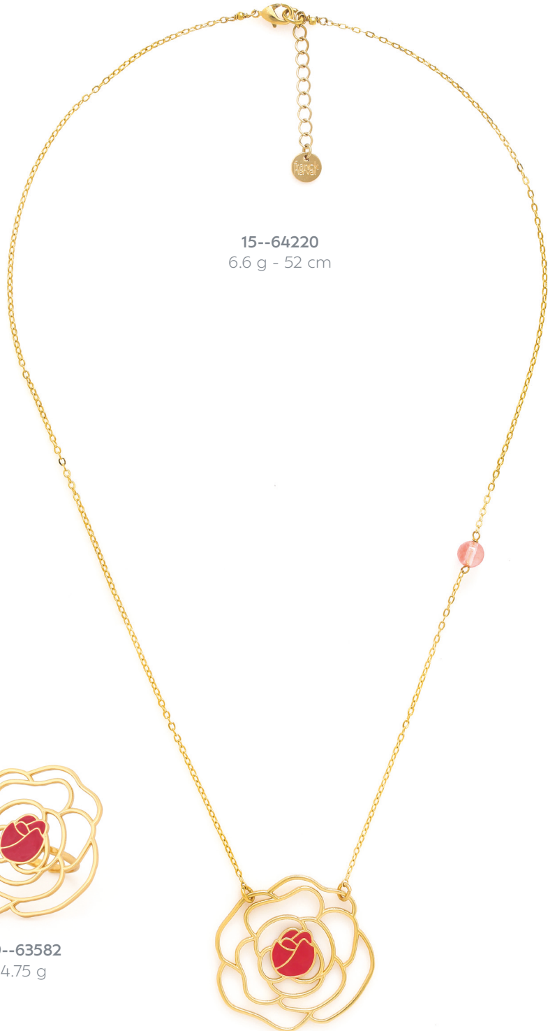
15--64220 6.6 g - 52 cm