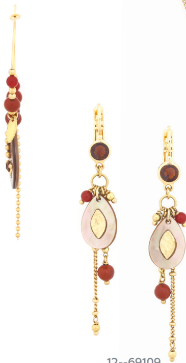
12--69109 4.65 g - 6.8 cm