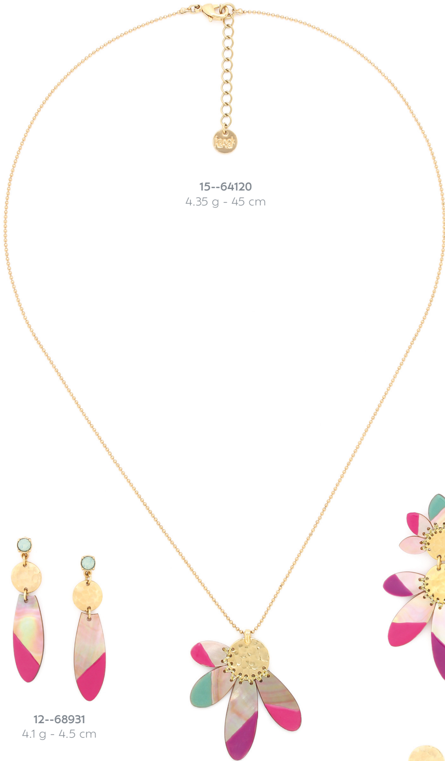
15--64120 4.35 g - 45 cm