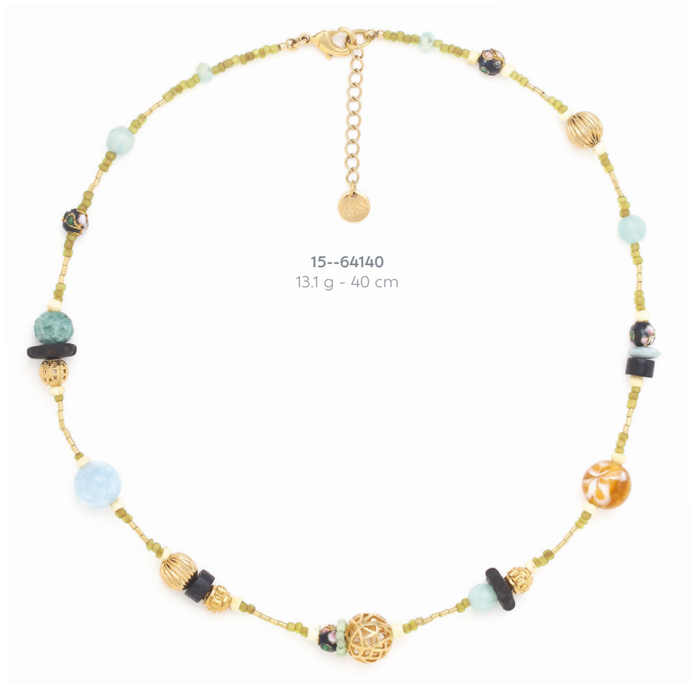
15--64140 13.1 g - 40 cm